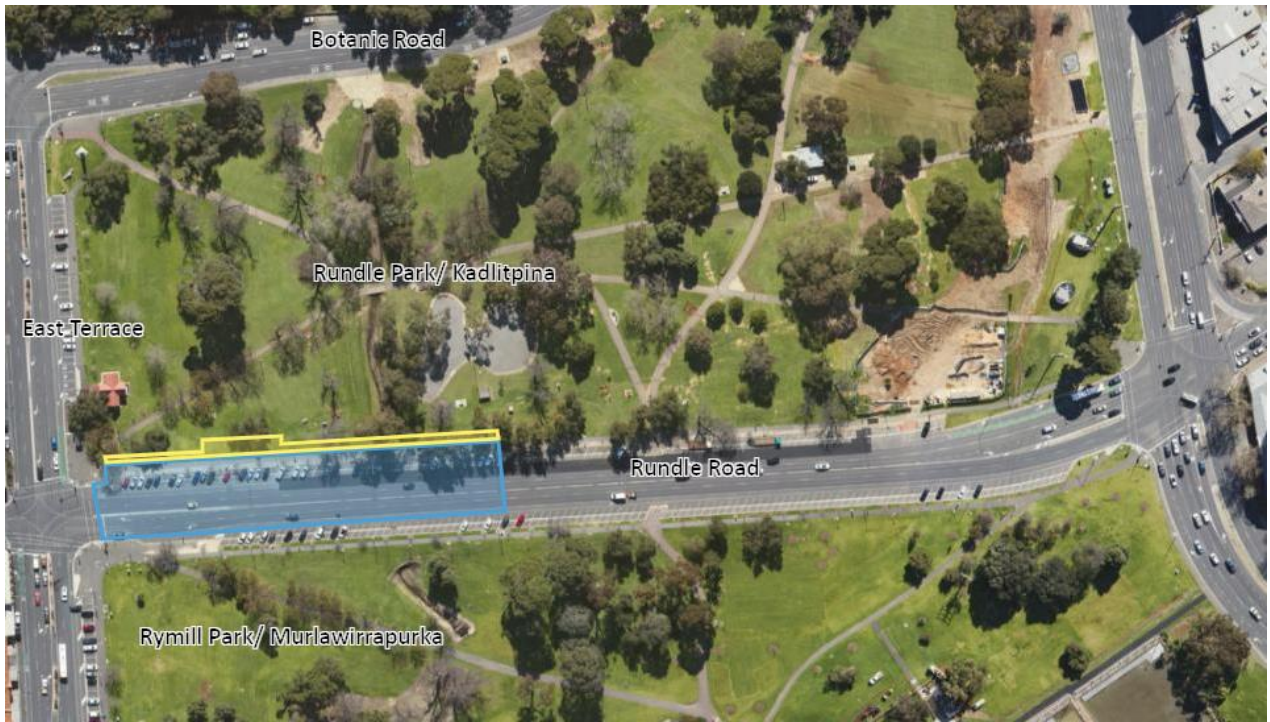
Image 1 - Event footprint on Rundle Road for exhibition Event footprint on Park Lands